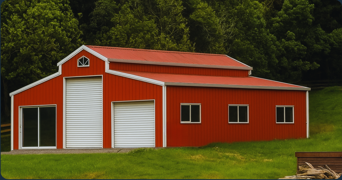
• Artistic Impression